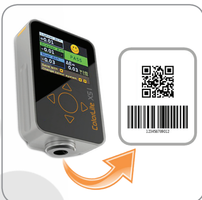
Integrated QR- and BAR-Code scanner for sample ID and name

The small sized instrument, made in Germany from a solid aluminium block, weighs just 270g. It is equipped with the latest high-definition technology allowing a high resolution spectral scan in 3.5nm steps in less than 1 second. The brilliant colour high contrast O-LED display makes a perfect user interface. The menu is simple and clear, so anyone can perform measurements fast and accurate. A further unique feature of the ColorLite XS1 is the integrated data-matrix and bar-code camera. This allows for fast effect sample identification and management.