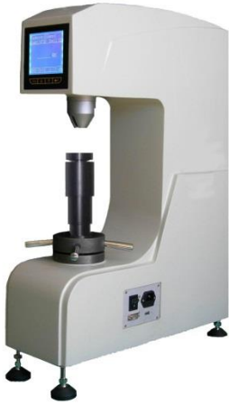
Digital Superficial Hardness tester KHR-450